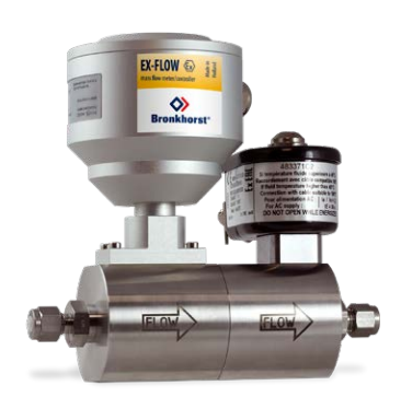
F-202AX Mass Flow Controller