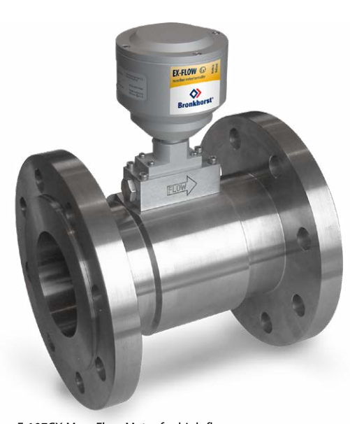
F-107CX Mass Flow Meter for high flow ranges (flanged type)