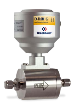
F-112AX Mass Flow Meter

For ranges of 700 bar rated MFCs please contact factory.