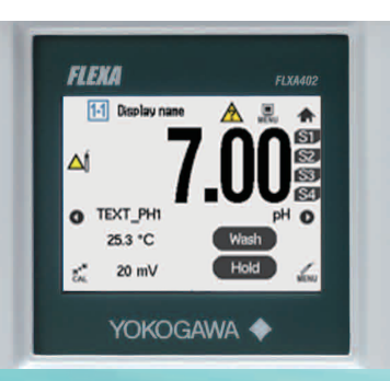
Easy to use touch screen