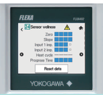
Advanced sensor diagnostics