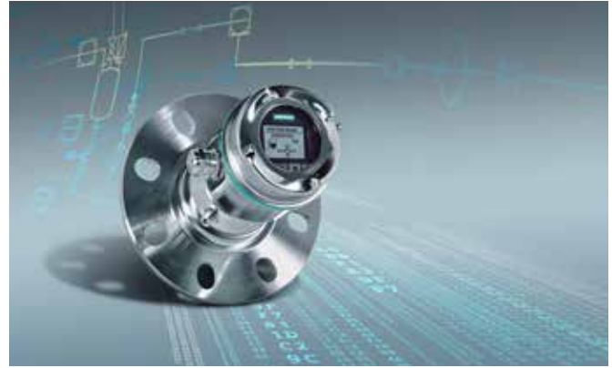
The SITRANS LR560 radar level transmitter features a unique 78 GHz frequency and narrow, 4-degree beam.

The Siemens Engineered Instrument Solutions team then got to work developing a custom level measurement package that combined the SITRANS LR560 with hardwired and wireless communication components. In the finished cement silos, Siemens replaced the existing hardwired level system with specially engineered LR560 transmitters for monitoring radar levels and sending the data via Modbus communication back to Lehigh Cement's control system. Additional level monitoring points with wireless transmission capabilities were installed in the raw material and clinker silos. The wireless solution included industrial-grade products like the reliable and secure SCALANCE Industrial Wireless LAN.